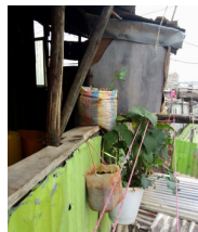
Urban Farming in existing space